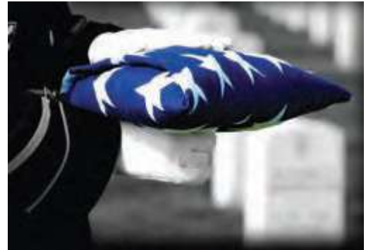
Giving honor to the one who sacrificed