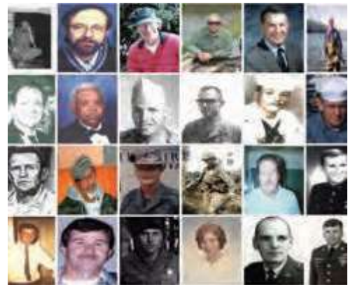
Honoree's personal page on the online In Memory Honor Roll