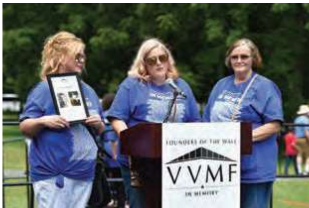
The In Memory ceremony is held annually in Washington, DC