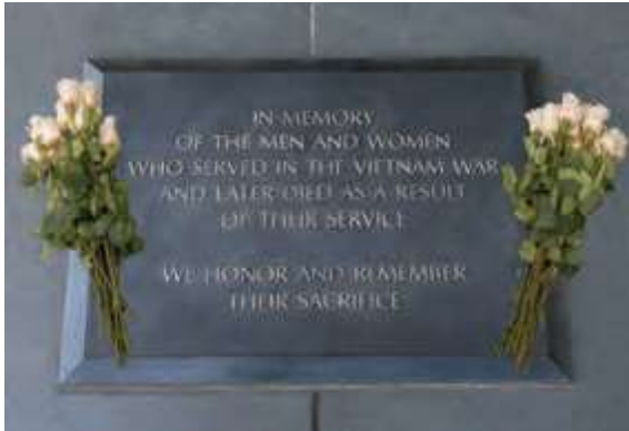
Plaque at the Vietnam Veterans Memorial in Washington, DC