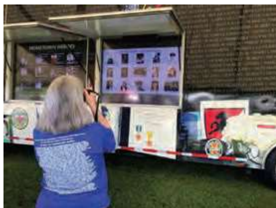
In Memory honorees on display at the Wall That Heals