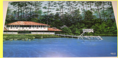
Gibson's Pond in Lexington

We have several copies of both of these prints for sale in our office. The cost is $10.00 each. The proceeds will be placed in our Veteran's Fund and/or Van Fund. Your donation is tax deductible and a receipt can be provided if you wish. To have a closer look at the prints, we have framed copies in our lobby. Please stop by our office M-F from 8 to 5 to purchase one or more of these beautiful prints!