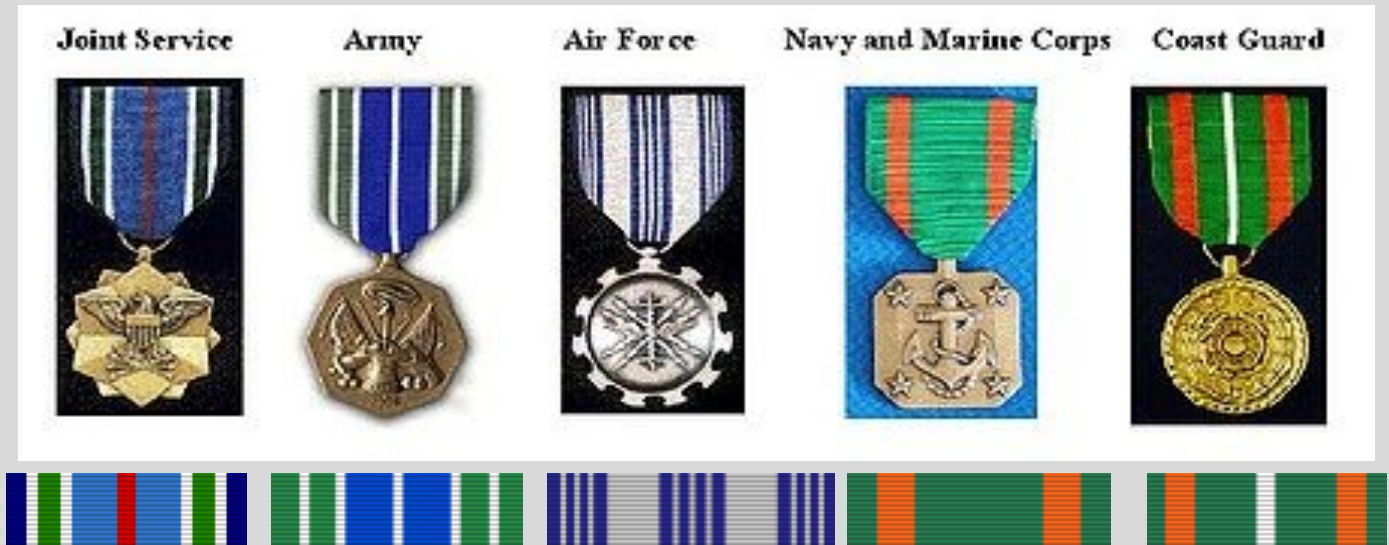
Picture of Achievement Medal and ribbons for the Joint Service, Army, Air Force, Navy and Marine Corps and Coast Guard

The Achievement Medal is a military decoration of the United States military. The Achievement Medal was first proposed as a means to recognize the contributions of junior officers and enlisted personnel who were not eligible to receive the higher Commendation Medal or the Meritorious Service Medal.