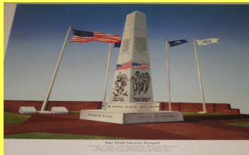
Veteran's Monument across from the Administration Building