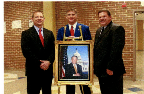
Presentation of Congressman Floyd Davidson Spence Portrait