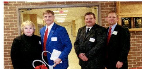
Ribbon Cutting by Spence Family