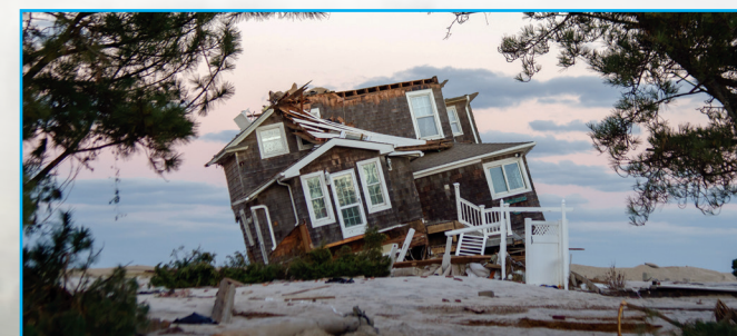
Mantoloking, N.J., Nov. 5, 2012 - This house was destroyed by the storm surge of Hurricane Sandy.